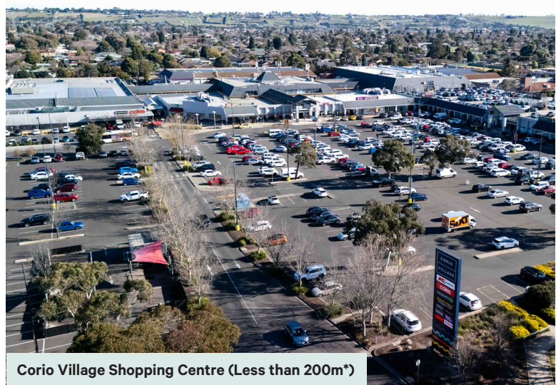
Corio Village Shopping Centre (Less than 200m*)