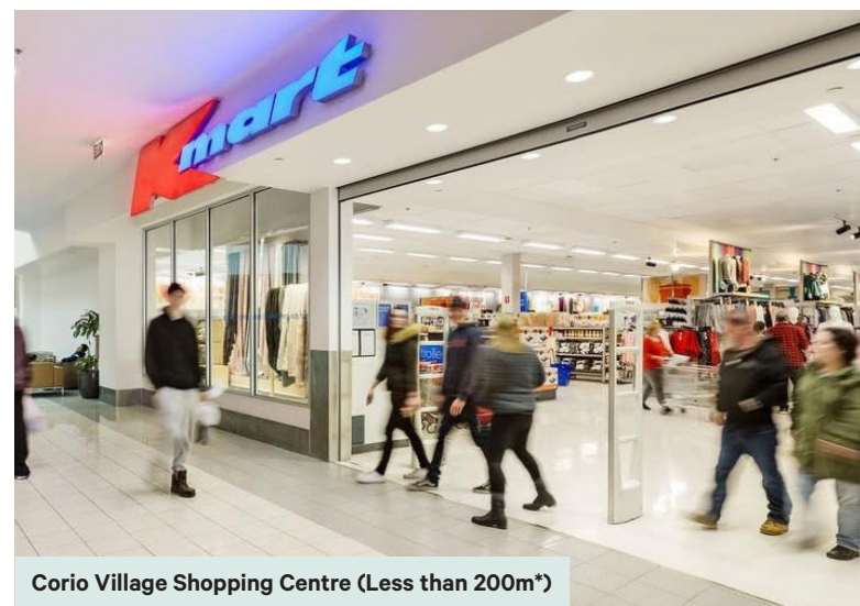
Corio Village Shopping Centre (Less than 200m*)